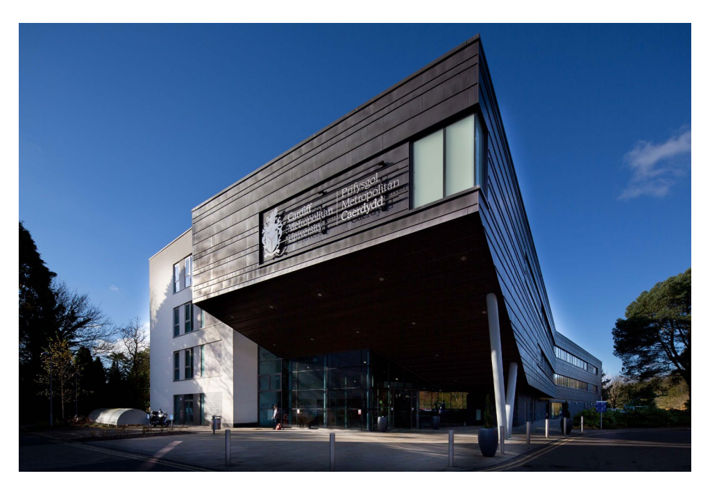
© NCC Education 2024, all rights reserved. The information on this fact sheet is correct at the time of publication. However, NCC Education reserves the right to make alterations at any time. JANUARY2024